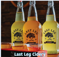
Last Leg Cidery