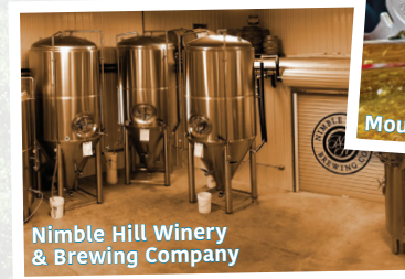
Nimble Hill Winery & Brewing Company

Numbers in circles correspond to map on back of brochure. Check with business for hours of operation.