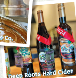
Deep Roots Hard Cider