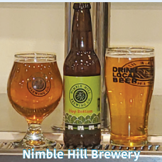
Nimble Hill Brewery