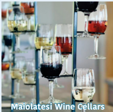
Maïolatesi Wine Cellars