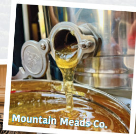
Mountain Meads Co.